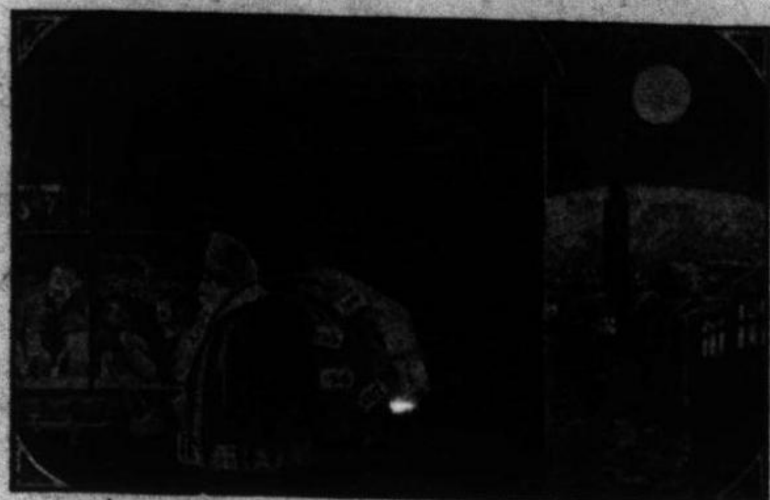
From a Prisoner in Knockree Internment Camp, Isle of Man.

On Bank Holiday about a thousand people visited the Alexandra Palace Internment Camp. Toiling up the hill in the bitter wind, their eyes wandered over the wide country stretched out beneath them, beautiful in its far undulations, in spite of the grey frost and leaden sky.